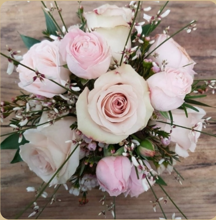
Meadow Dreams Florist meadowdreamsflorist.co.uk