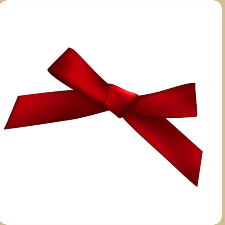
Grand Jour Bridal Boutique www.grandjour.co.uk