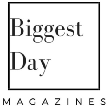
Biggest Day Magazines biggestday.co.uk