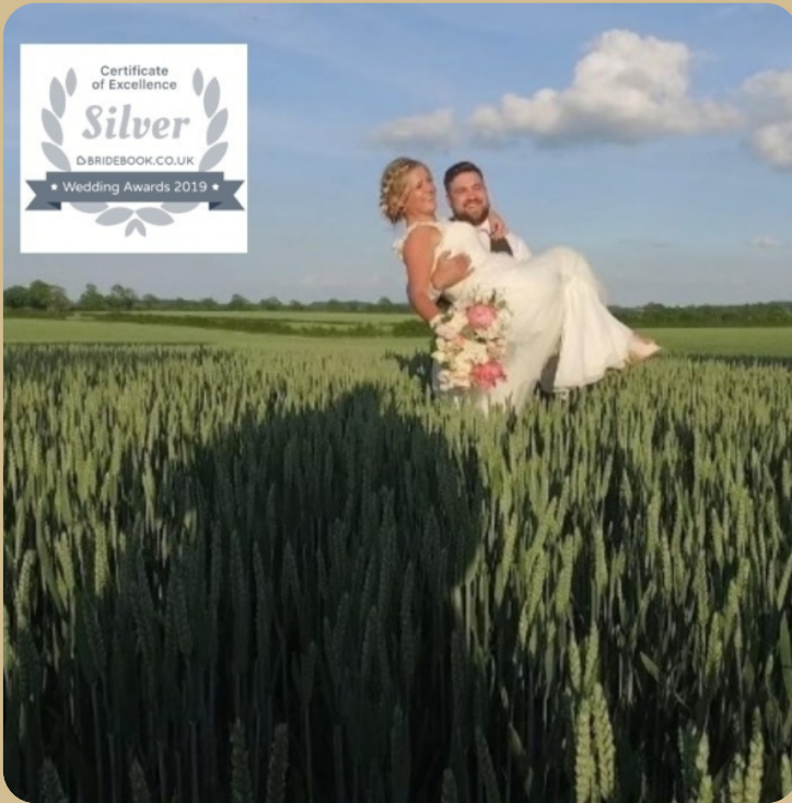
Severn Scent Videos www.severnscentvideos.com