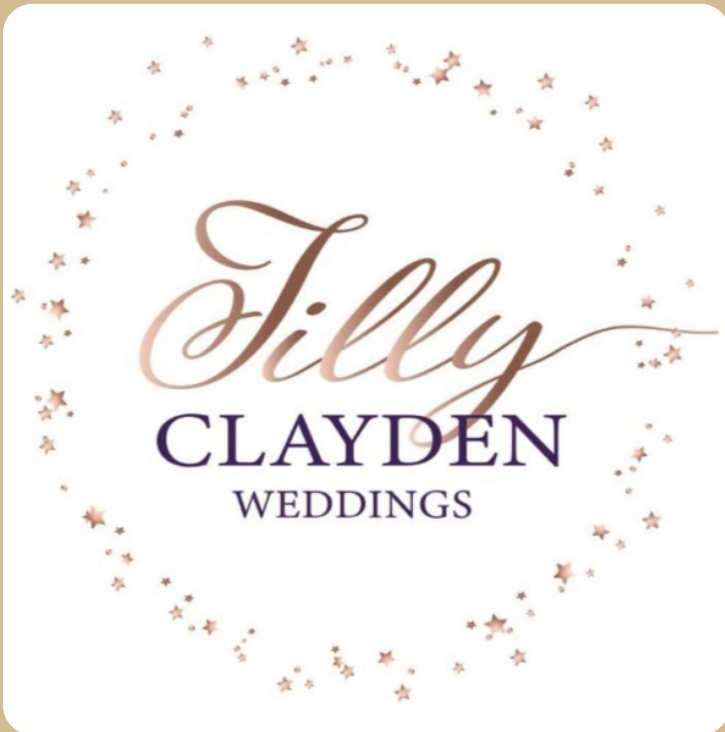
Tilly Clayden Weddings tillyclayden.com