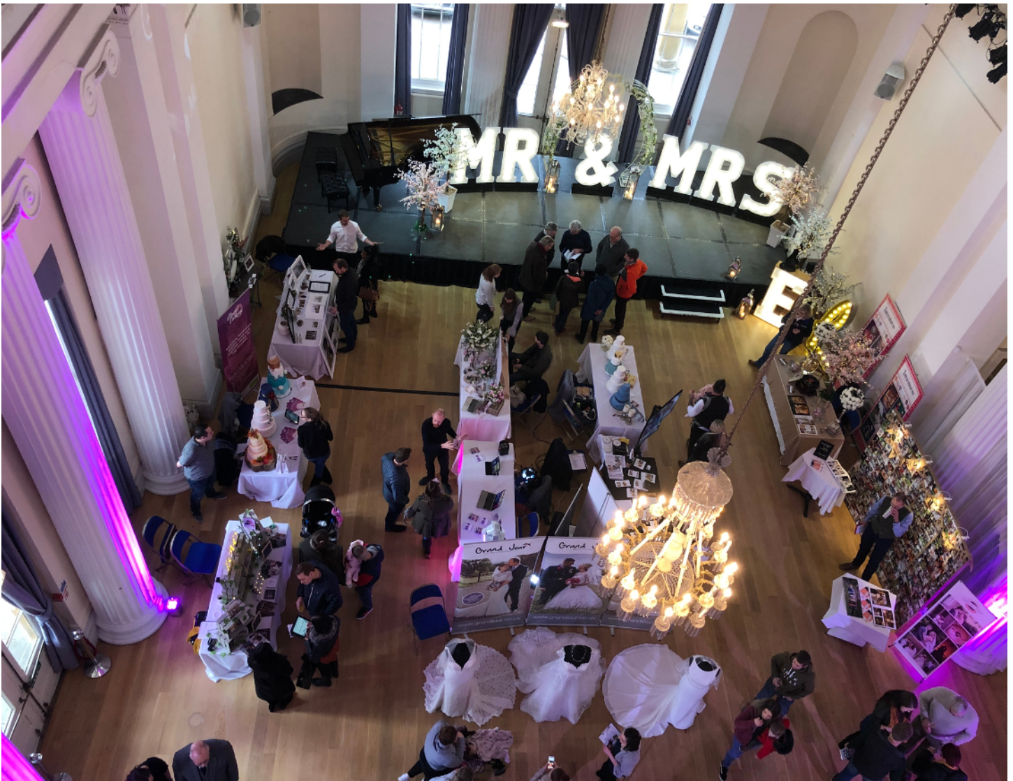
Pittville Pump Room Wedding Supplier Displays Looked amazing from Upstairs too!