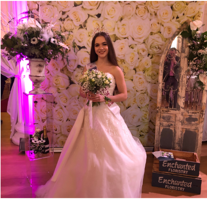
Special guest, Miss Cotswolds