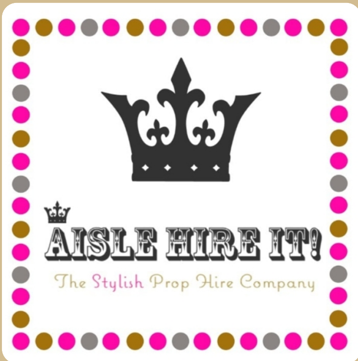
Aisle Hire It www.aislehireit.co.uk