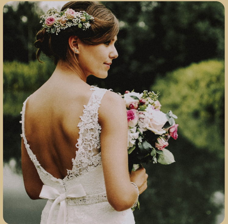
Chivers Weddings www.chiversweddings.com