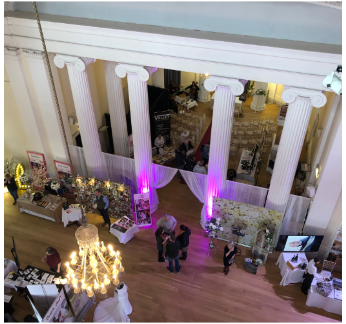
Stunning displays & Lighting - Apse Room