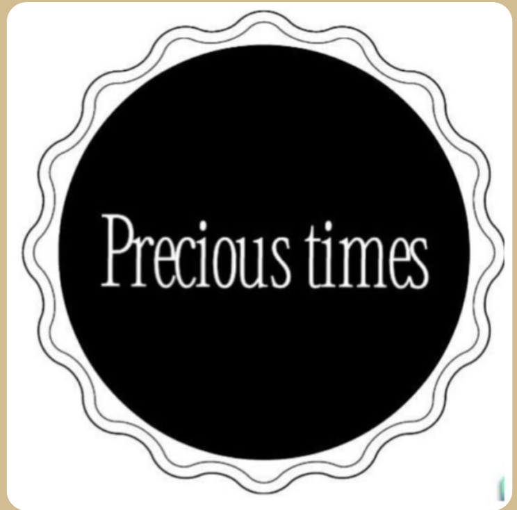
Precious Times www.precious-times.com