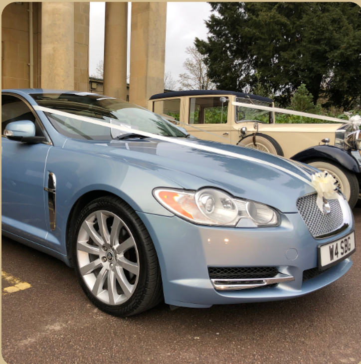
Something Blue Gloucester www.somethingbluegloucester.co.uk