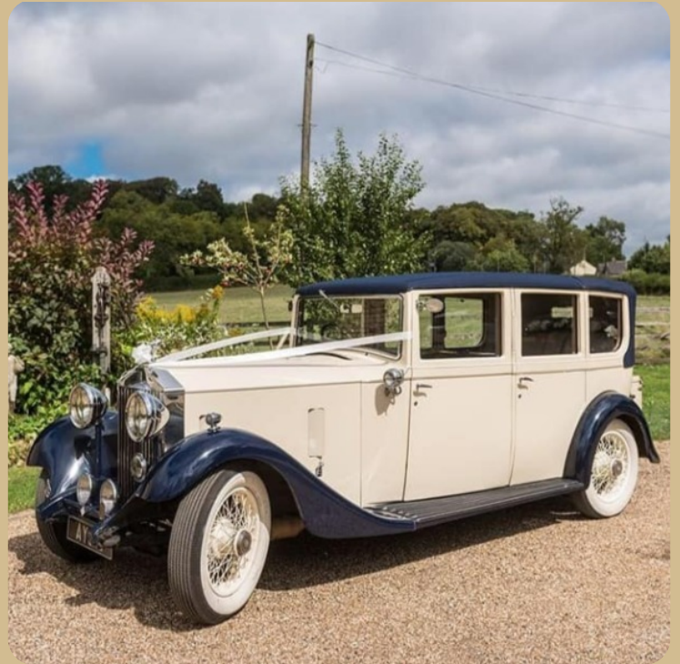
Enchanted Carriages www.enchantedcarriages.co.uk