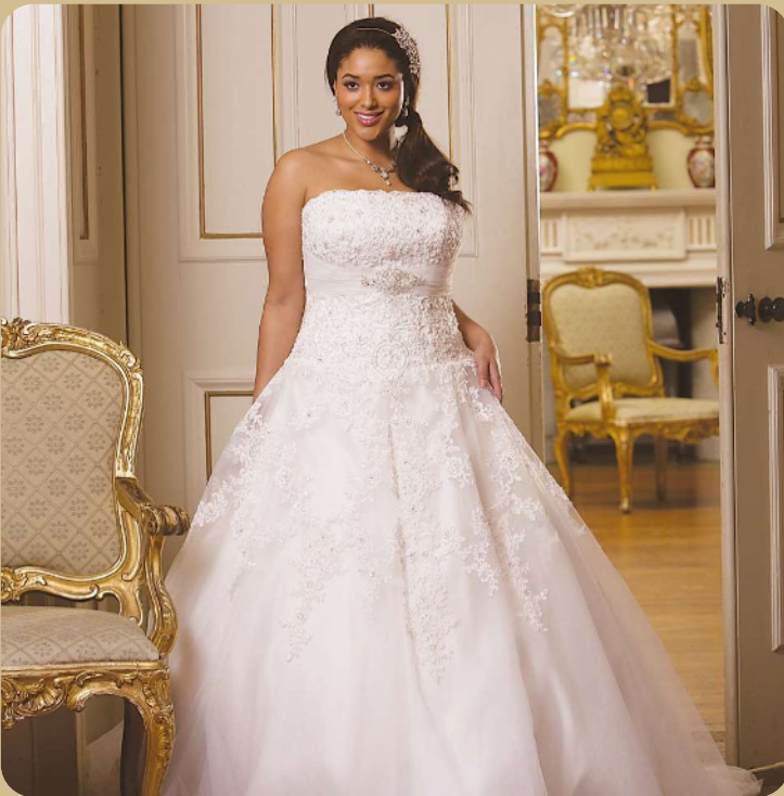
Fairytale Occasions www.fairytaleoccasions.co.uk