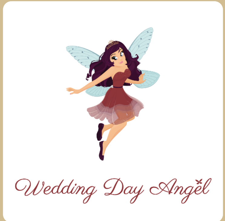
Wedding Day Angel