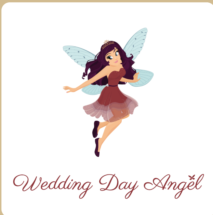
See all the supplier information at www.weddingdayangel.com