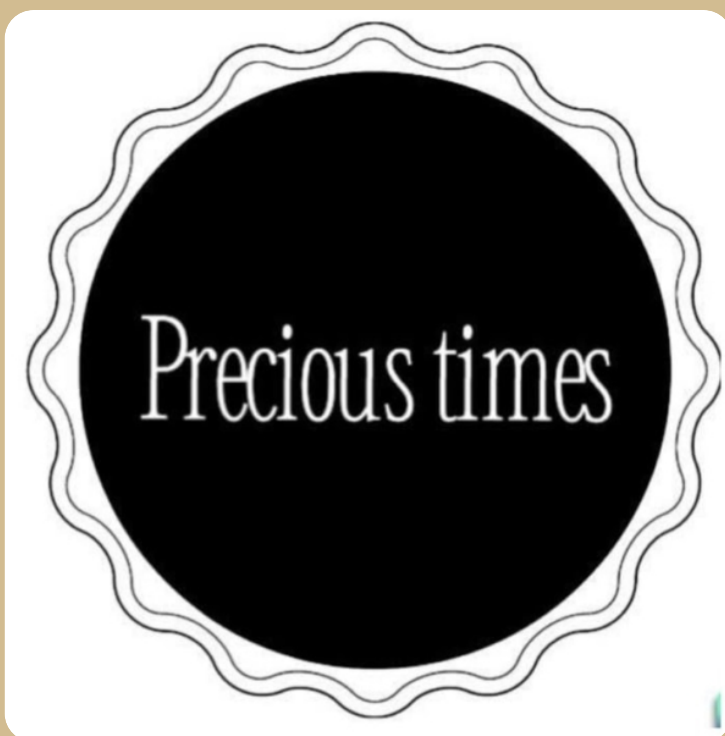
Precious Times www.precious-times.com