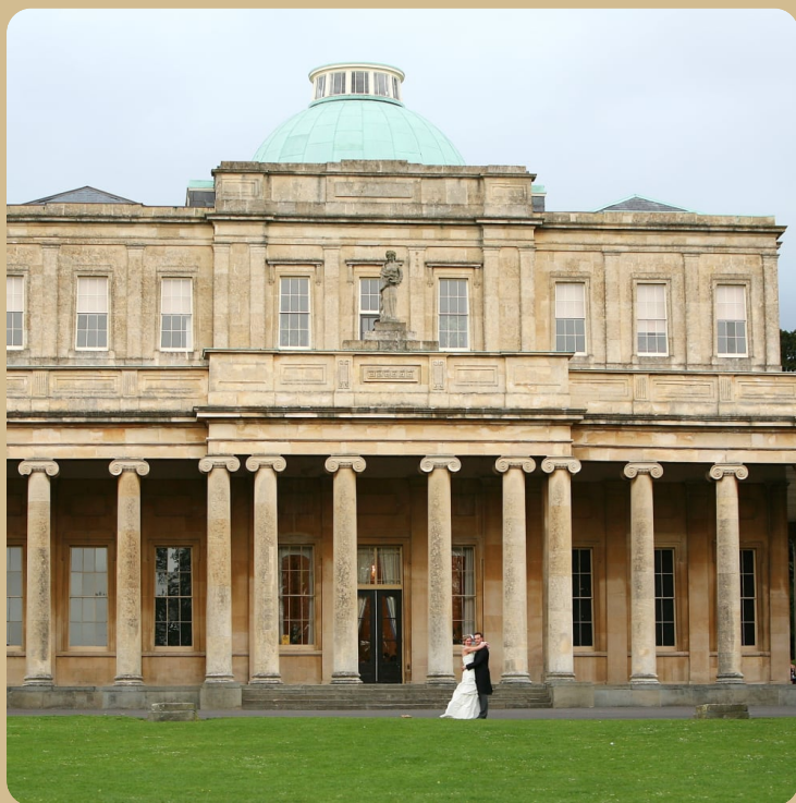
Pittville Pump Room, Cheltenham 20th Jan 2019