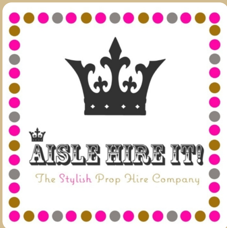
Aisle Hire It www.aislehireit.co.uk