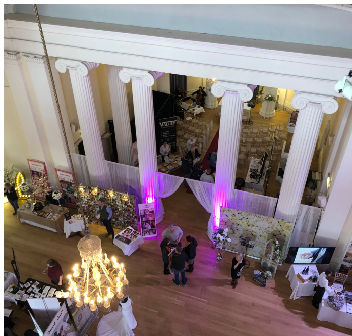
Stunning displays & Lighting - Apse Room