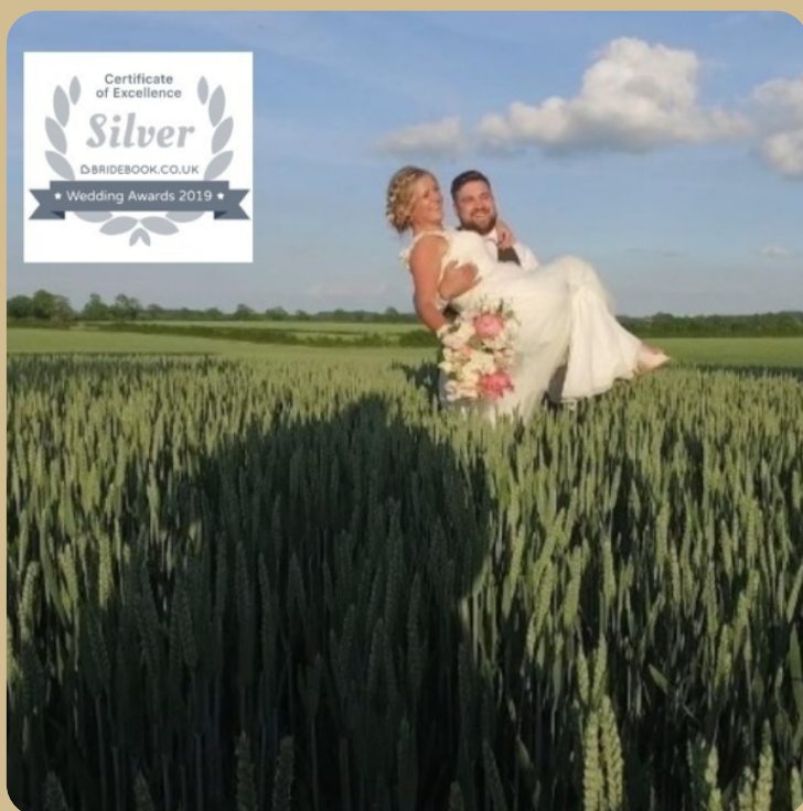
Severn Scent Videos www.severnscentvideos.com