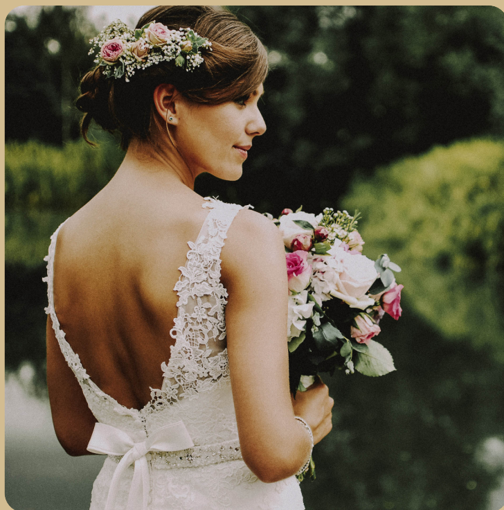
Chivers Weddings www.chiversweddings.com