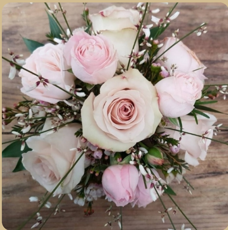
Meadow Dreams Florist meadowdreamsflorist.co.uk