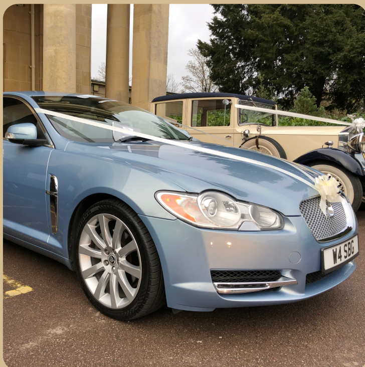
Something Blue Gloucester www.somethingbluegloucester.co.uk