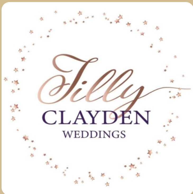
Tilly Clayden Weddings tillyclayden.com