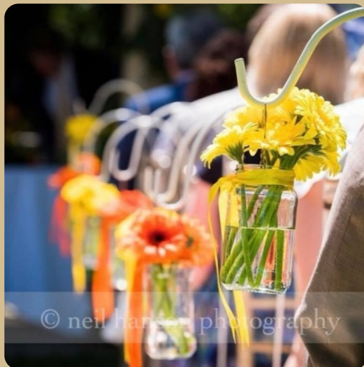
Enchanted Floristry www.enchantedfloristry.co.uk