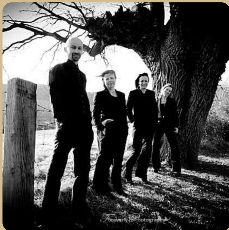
Capriccio Quartet capriccioquartet.co.uk