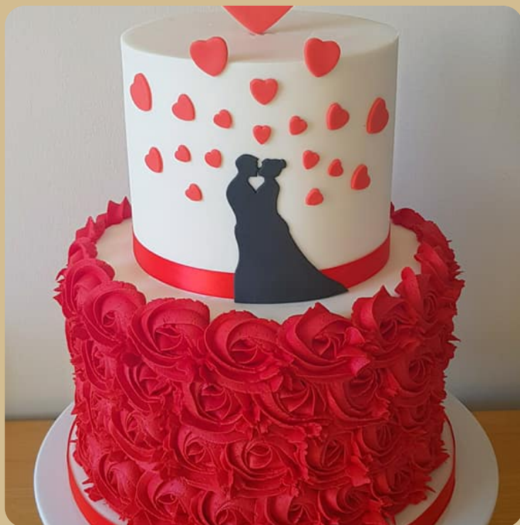
Clare's Cakery Visit Facebook Page