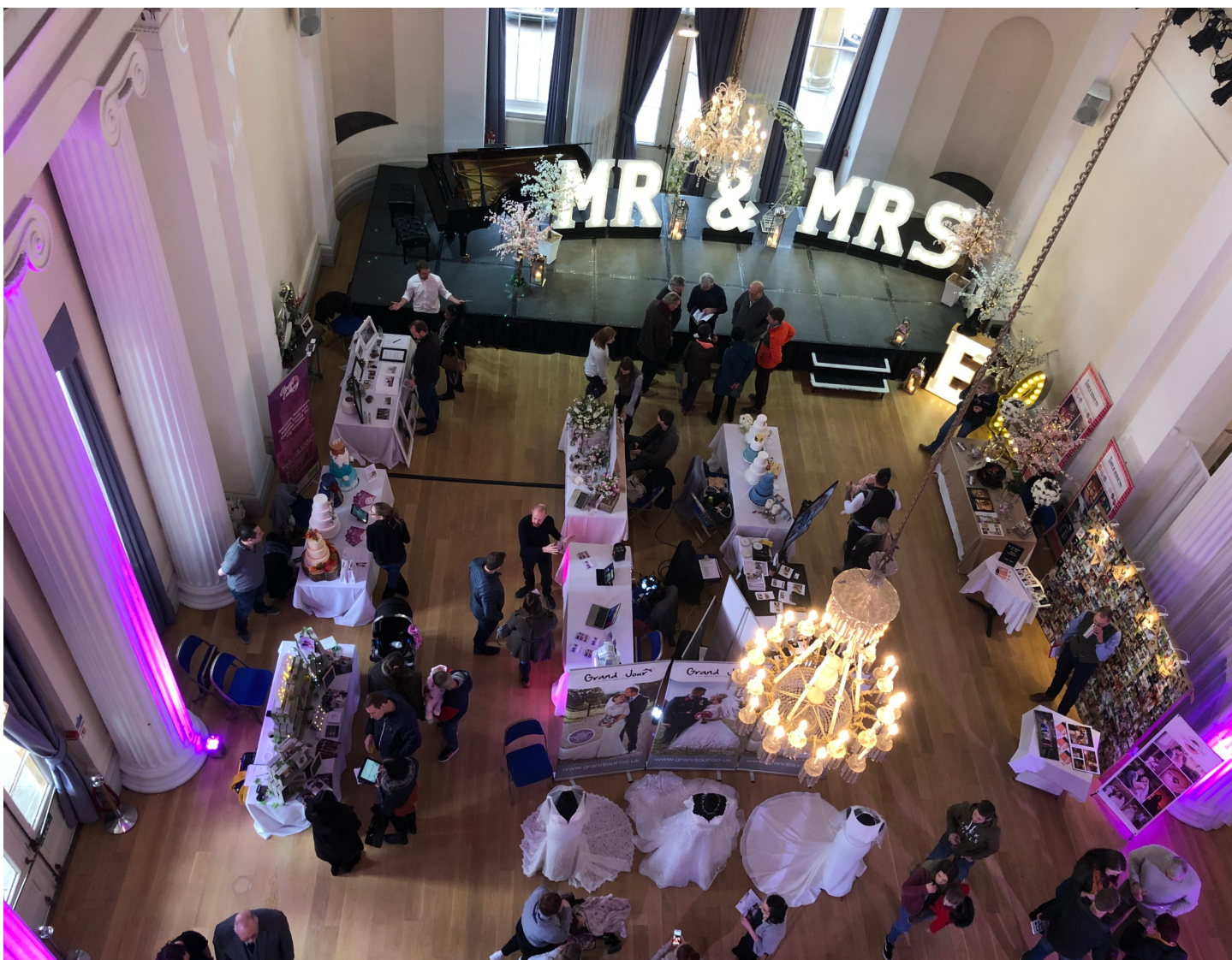
Pittville Pump Room Wedding Supplier Displays Looked amazing from Upstairs too!