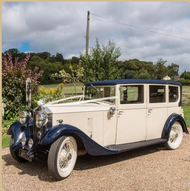
Enchanted Carriages www.enchantedcarriages.co.uk