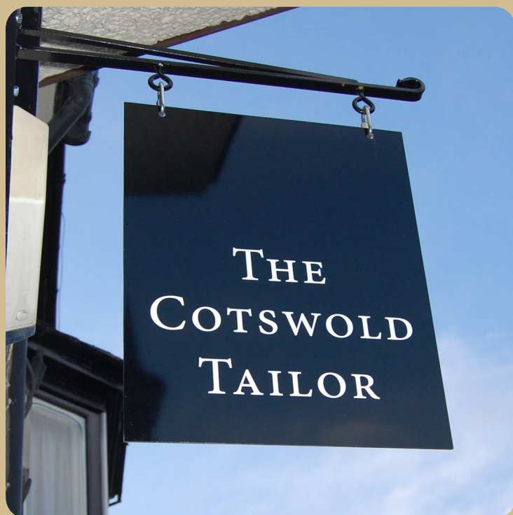
The Cotswold Tailor www.suitstailored.com