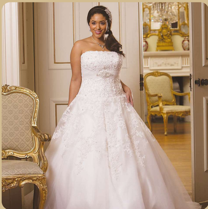
Fairytale Occasions www.fairytaleoccasions.co.uk