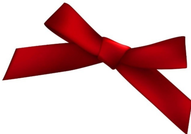
Grand Jour Bridal Boutique www.grandjour.co.uk