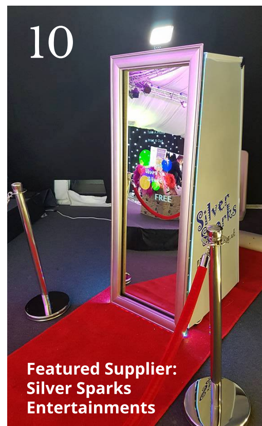
Featured Supplier: Silver Sparks Entertainments